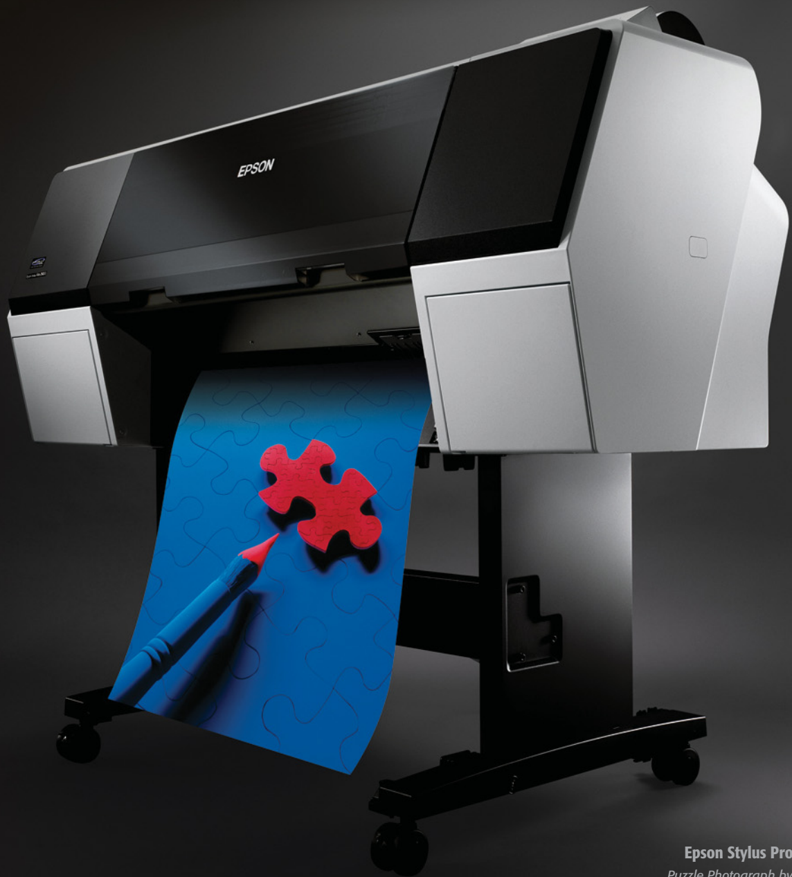
Epson Stylus Pro 7900 – 24"