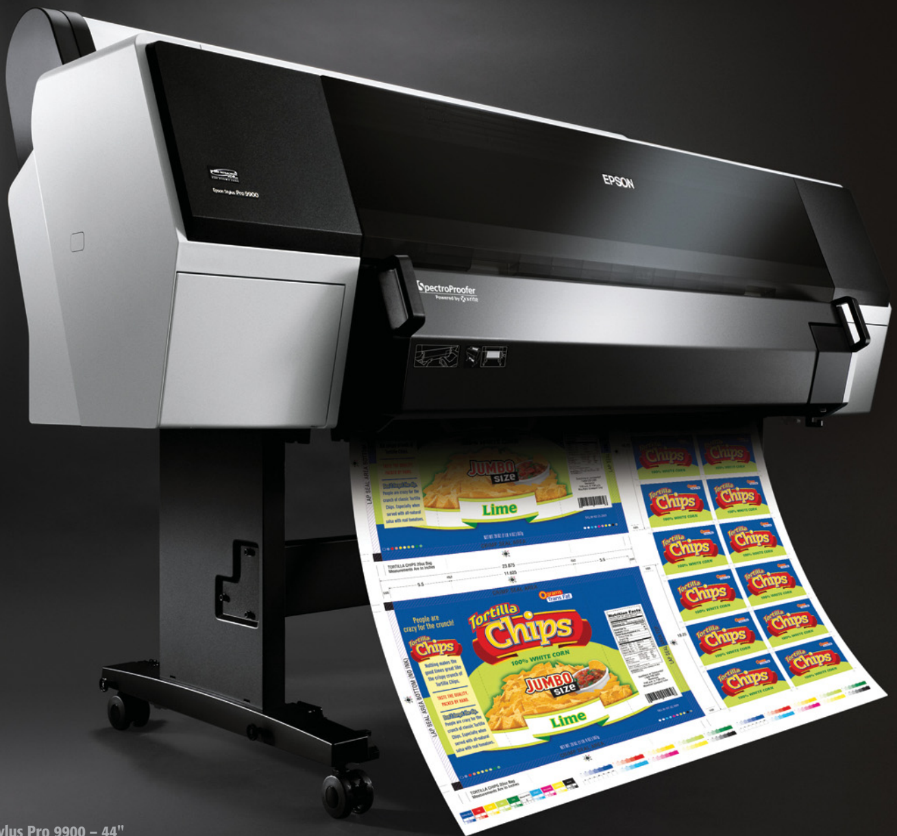
Epson Stylus Pro 9900 – 44"