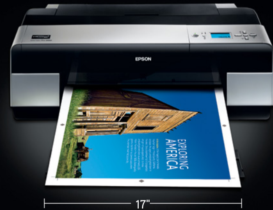
Epson Stylus Pro 3880 | $1,495

The Smart Choice for Smaller Design Studios and Freelancers.