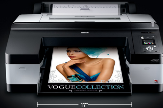
Epson Stylus Pro 4900 | $2,995

The Printer for Art Directors and Designers Who Demand the Very Best.