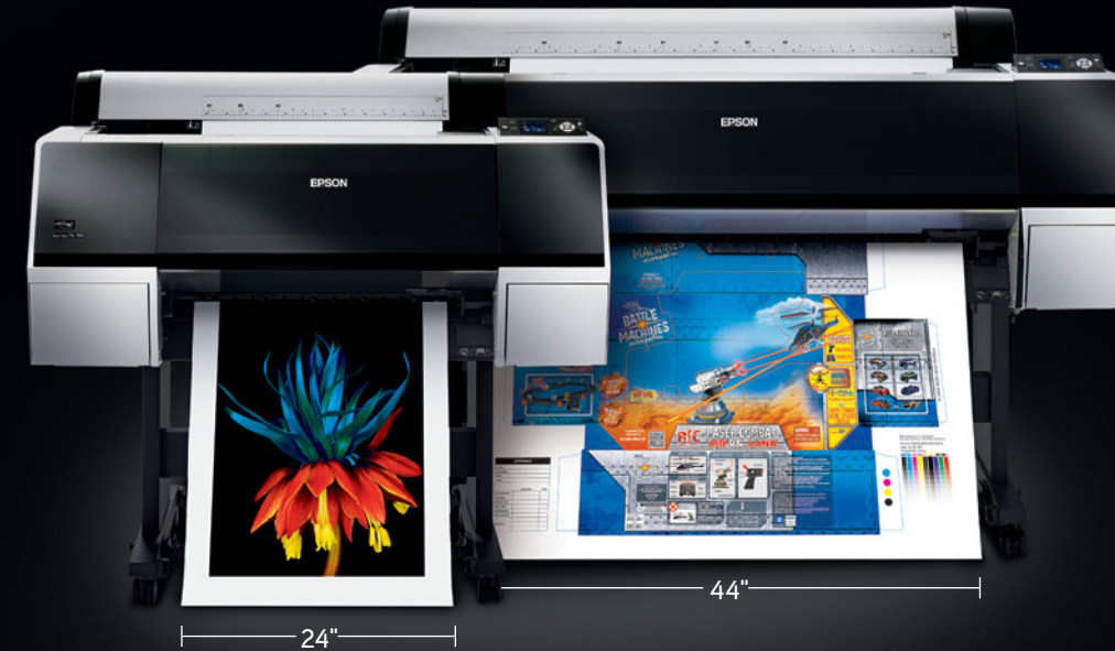
Epson Stylus Pro 7890 and 9890 | $3,495 | $5,495

Forget Trimming, Tiling, and Splicing Your Comps — Forever.