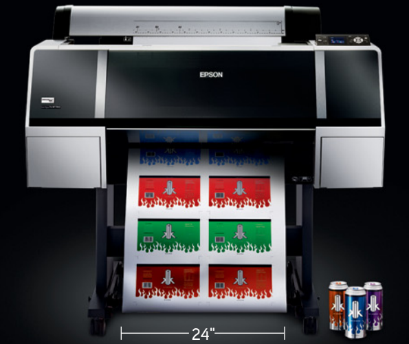
Epson Stylus Pro WT7900 | $6,995

A New Generation of Package Prototyping.